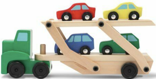
Set 44 Php 200 Melissa & Doug car carrier