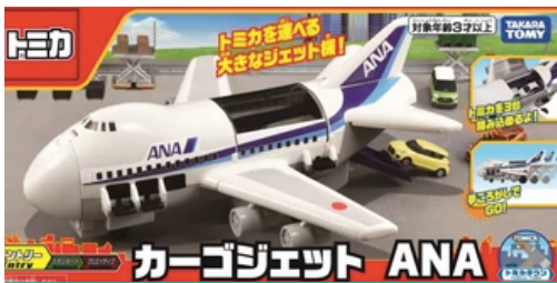
Set 43 Php 300 ANA Cargo Jet