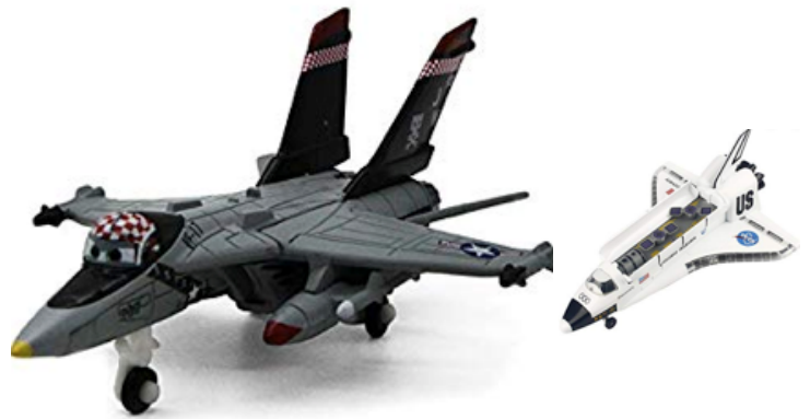
Set 46 Php 200 Jet (Movie, Planes ) (100), NASA rocket ship (100)