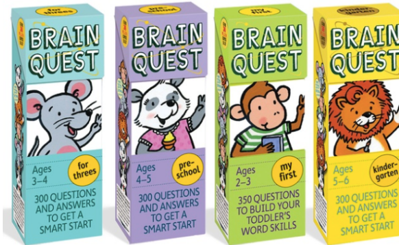
Set 47 Brain Quest Decks (100 each set of 2 decks): Ages 2-3, 3-4, 4-5, 5-6