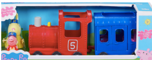
Set 45 Php 100 Peppa Pig train (characters not included)