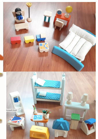
Set 48 Php 400 Chalet + accessories (right photos)